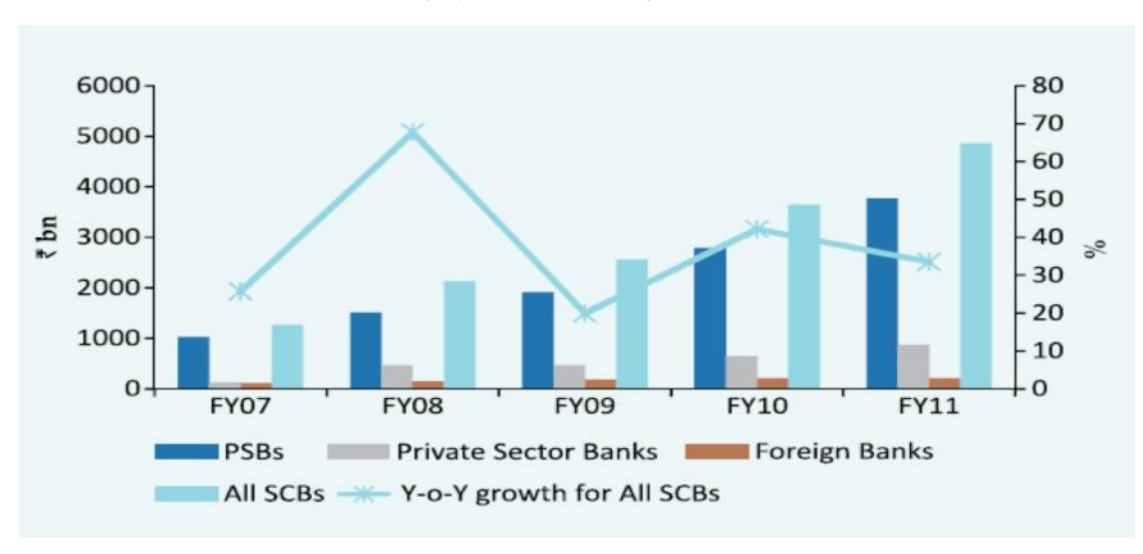
Bank Category wise outstanding credit to MSMEs